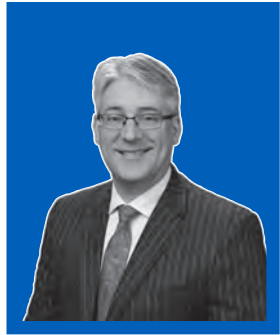
Senator Mike Halpin